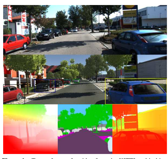
Figure 1: Top: a frame of a video from the KITTI multi-object tracking benchmark [1]. Middle: the corresponding rendered frame of the synthetic clone from our Virtual KITTI dataset with automatic tracking ground truth bounding boxes. Bottom: automatically generated ground truth for optical flow (left), scene- and instance-level segmentation (middle), and depth (right).

Research-Development/Computer-Vision/Proxy-Virtual-Worlds