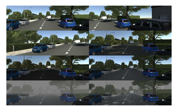
Figure 3: Simulated conditions. From top left to bottom right: clone, camera rotated to the right by 15°, to the left by 15°, "morning" and "sunset" times of day, overcast weather, fog, and rain.

To illustrate some of the vast possibilities, Virtual KITTI includes some simple changes to the virtual world that translate in complex visual changes that would otherwise require the costly process of re-acquiring and re-annotating data in the real-world. First, we turned the camera to the right and then to the left, which lead to some considerable change of appearances of the cars. Second, we changed lighting conditions to simulate different time of the day: