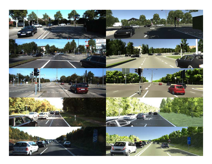
Figure 2: Frames from 5 real KITTI videos (left, sequences 1, 2, 6, 18, 20 from top to bottom) and rendered virtual clones (right).

The first step of our approach consists in the acquisition of a limited amount of seed data from the real world for the purpose of calibration. Two types of data need to be collected: videos of real-world scenes and physical measurements of important objects in the scene including the camera itself. The quantity of data required by our approach is much smaller than what is typically needed for training or validating current computer vision models, as we do not require a reasonable coverage of all possible scenarios of interest. Instead, we use a small fixed set of core real-world video sequences to initialize our virtual worlds, which in turn allows one to generate many varied synthetic videos. Furthermore, this initial seed real-world data results in higher quality virtual worlds (i.e. closer to real-world conditions) and to quantify their usefulness to derive conclusions that are likely to transfer to real-world settings.