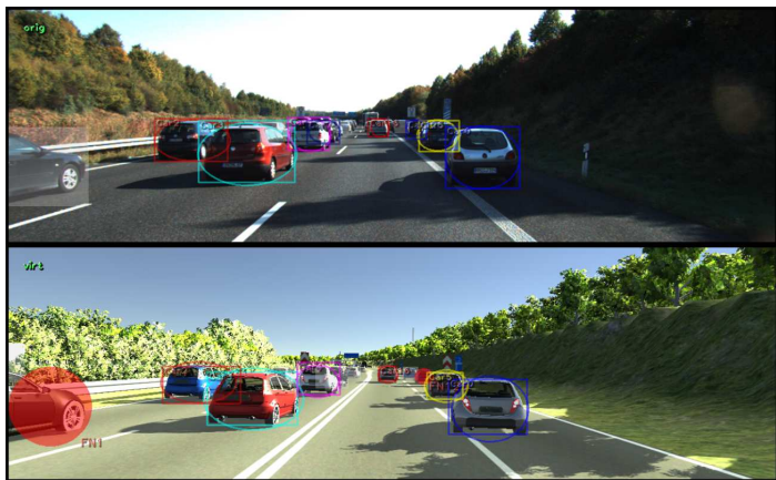
Figure 5: Predicted tracks on matching frames of two original videos (top) and their synthetic clones (bottom) for both DP-MCF (left) and MDP (right). Note the visual similarity of both the scenes and the tracks. Most differences are on occluded, small, or truncated objects.